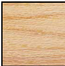
Natural Tint Base*